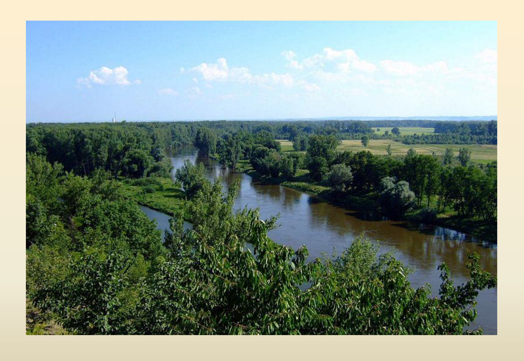
Confluence of the Elbe and Vltava as seen from Mělník