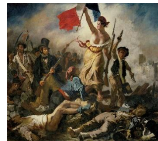
The symbol of the French Revolution Pic. 1 1

people citizens economic ended absolute monarchy bloodbath guillotine Napoleon Bonaparte began nations